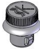
TF0405194 STANDARD VERSION PA66 GREY

Utilising bespoke insert moulding equipment has ensured that the product is manufactured to the highest standard. This together with very accurate assembly equipment means that the Tech-Fast product meets all industry needs.