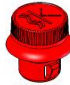
TF0405195 HI TEMP VERSION PBT RED